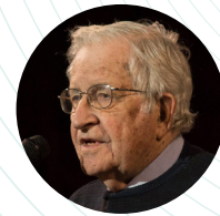
Noam Chomsky, Laureate Professor of Linguistics, University of Arizona

Considered the founder of modern linguistics, Noam Chomsky is one of the most cited scholars in modern history.