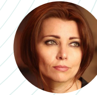
Elif Shafak, Author and Activist

Elif Shafak is a Booker nominated novelist, journalist and political scientist whose work has been published in 50 languages.