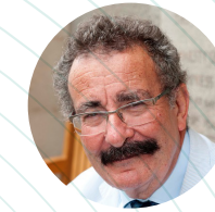
Robert Winston, Imperial College London

Robert Winston is a world-renowned expert in fertility and genetics. He is Vice-President of the Royal College of Music and sits in the House of Lords.