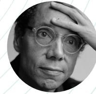
Malcolm Gladwell, Internationally Bestselling Author

Malcolm Gladwell is the author of five international bestsellers. He was named one of the 100 most influential people by Time magazine and one of the Foreign Policy's Top Global Thinkers.